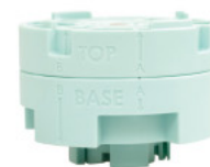
medium press inserts