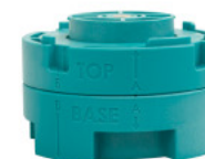
large press inserts