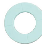
medium cutting die