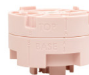
small press inserts