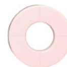
small cutting die