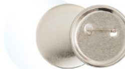
pieces for 10 large buttons 2.25 in (58 mm)