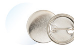
pieces to make 5 medium buttons (1.45 in / 37 mm)