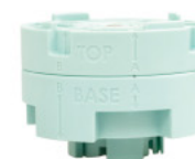
medium press inserts