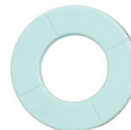
medium cutting die